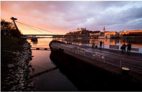
Danube river basin