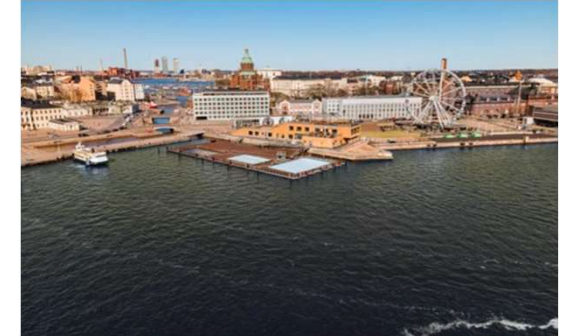
Baltic & North sea basin