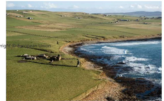
Atlantic & Arctic coast