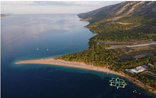
Mediterranean sea basin